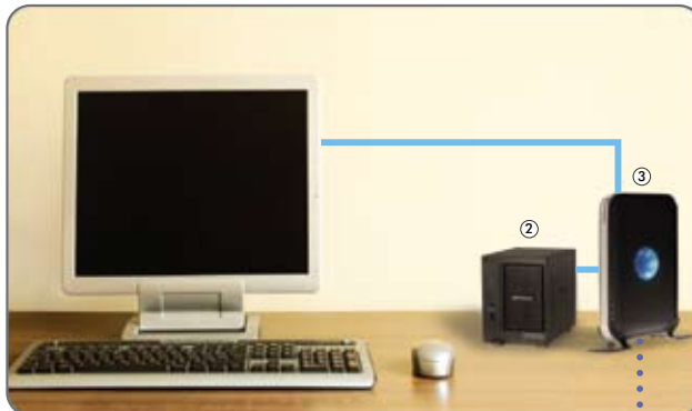
2. Network attached storage (ReadyNAS Duo) 3. Wireless-N Router

Connect your Digital Entertainer Elite to your home network via Wireless, Wired Ethernet, Powerline, or MoCA (Coax Networking).