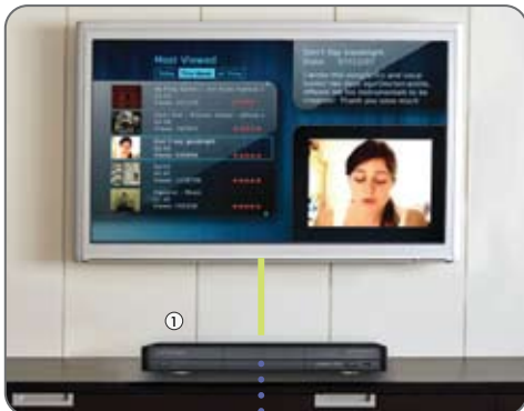
1. Digital Entertainer Elite